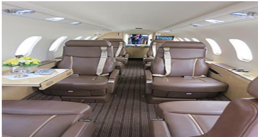
Fig.1: Seating arrangement of Lear Jet-45 with 9 seating capacity